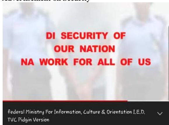
Fig. 4: Advertisement on Security

Nigerians, unasabiwetin be Improvised Explosive Device weydemdey call (IED)? IED dey come for