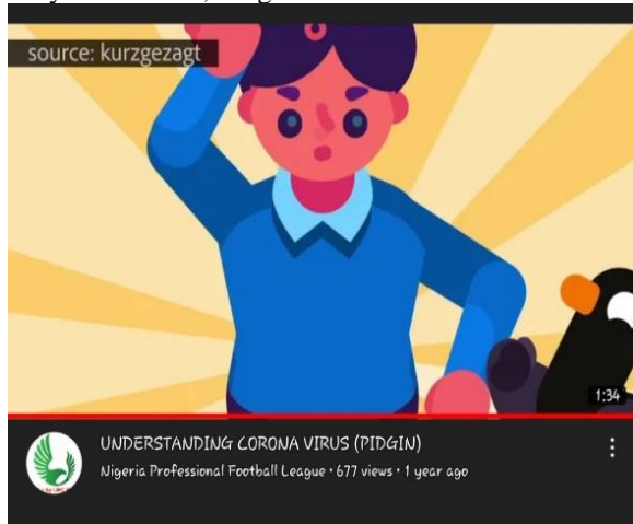
Fig. 3: Safety Measures on Corona Virus

No shake anybody No hug anybody Hold your sef If you fit dey for house, dey Make people weysabiwetin to do help us find solution. Mi people, de solution dey our hands so. Make we respect ourself do de right tin. If you get any of de symptoms, fever, dry cough and wen I dey hard for you to breath, abeg call this number so.